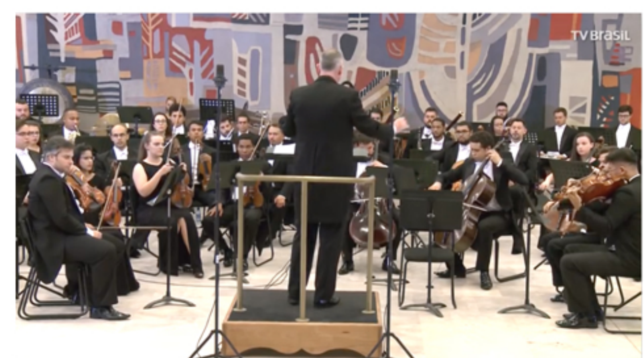
'TV Brasil no Itamaraty' recebe a Orquestra Filarmônica d... tvbrasil